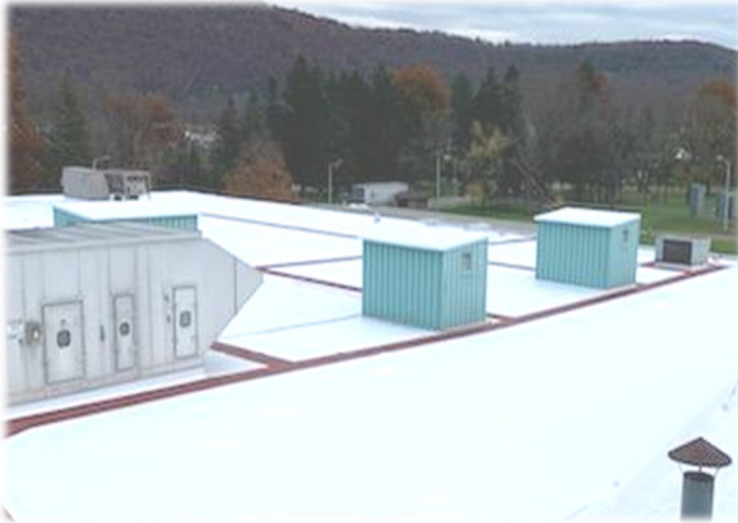
Identifies and protects walkways