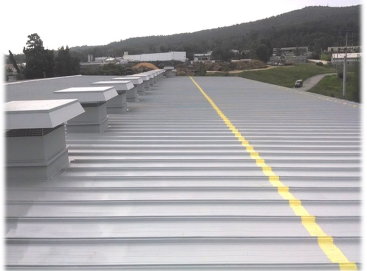
Can be used as a caution stripe at roof edges to provide a highly visible warning at the most hazardous areas of a roof