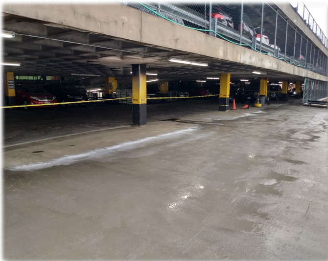
This worn out parking garage deck was resurfaced using the Acrycrete System, making it water tight and adding many more years of service