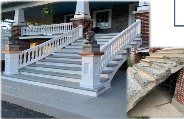
Avoid costly tear outs by restoring with Acrycrete