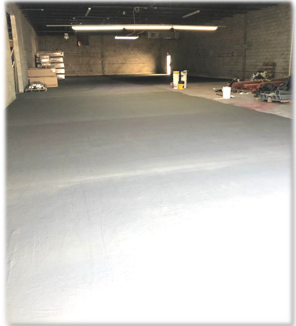
Damaged manufacturing and warehouse floors are expensive to replace. Acrycrete can solve a variety of floor issues with minimal disruptions of operations

Acrylabs Acrycrete is a specialty product that combines portland cement with an advanced polymer formulation to create an extremely versatile and hard wearing finish. Acrycrete bonds to all cleaned and prepped concrete surfaces and is easy to use. It can also be applied to the standard Acrylabs reinforced membrane or it can be coated with Acrylabs DEK-coat to create an attractive finish.