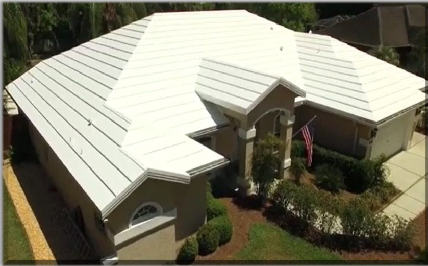
Completed look of an Island Style Roof